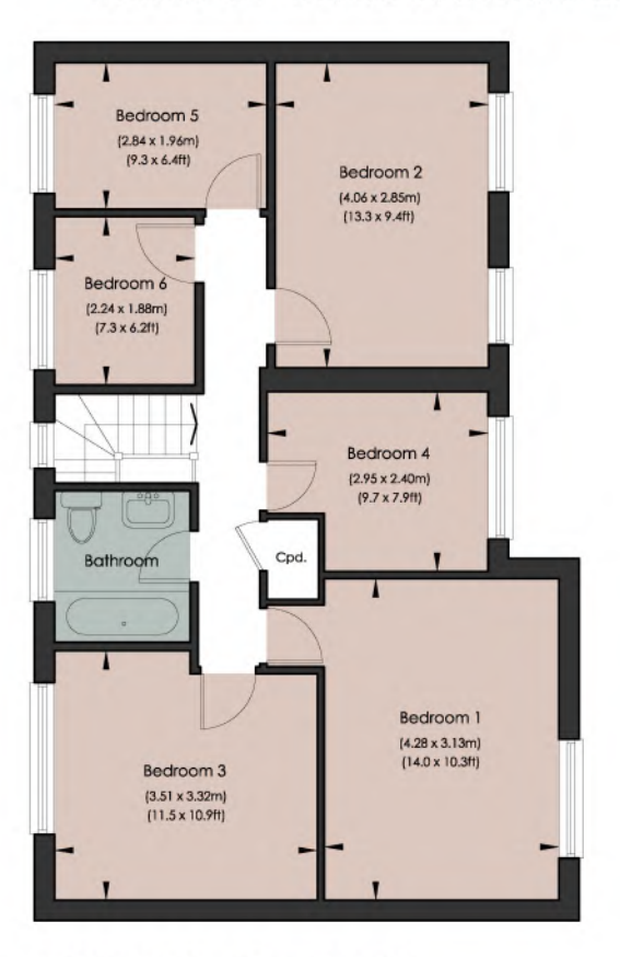
FIRST FLOOR GIA = 69 sqm (743 sqft)