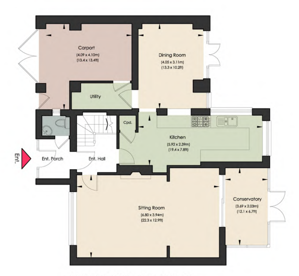
GROUND FLOOR GIA = 98 sqm (1055 sqft)