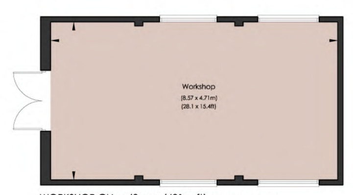
WORKSHOP GIA = 40 sqm (431 sqft) (LOCATION NOT RELATIVE)